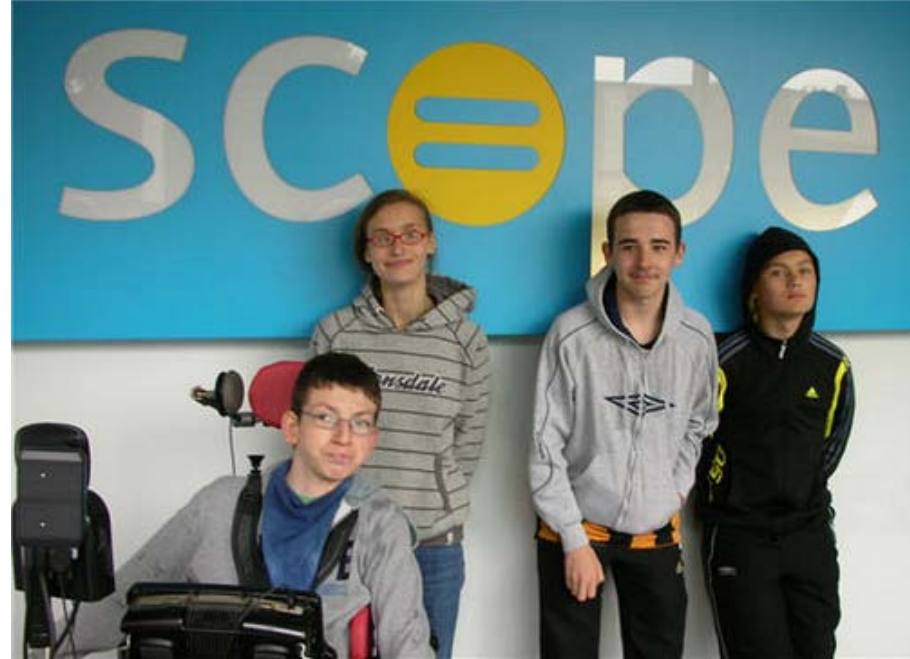
A group of pupils from Endeavour, supported by the ACE project, in association with Hull and East Yorkshire MIND, visited Scope's office in June 09.